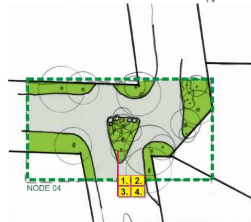
TRIANGLE 'ISLAND' NODE PLAN